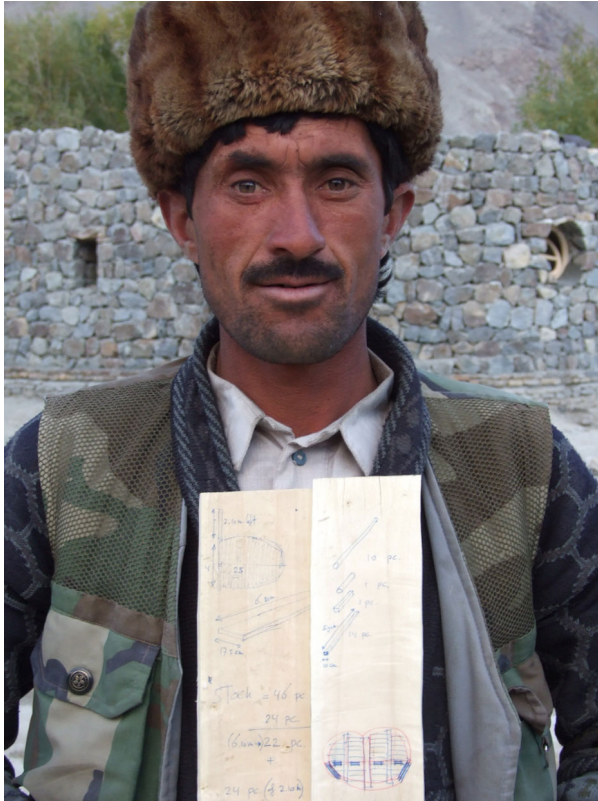
The Good Cause - Architecture of Peace: A worker holding a design drawing.