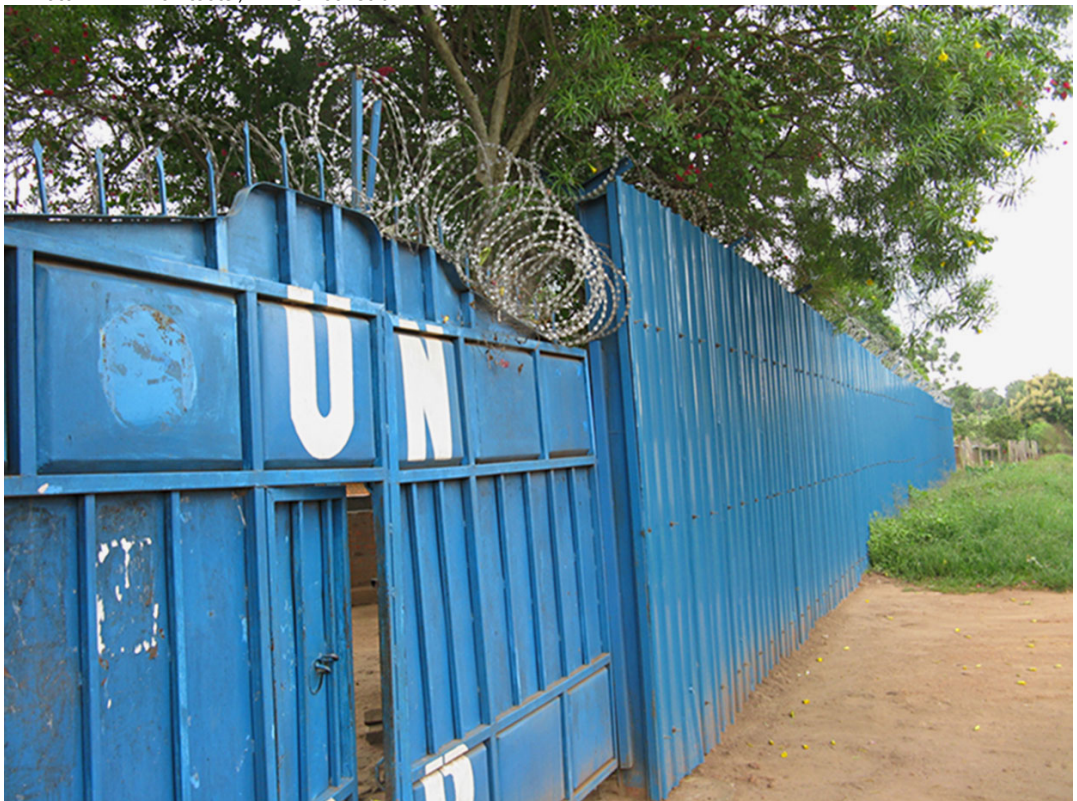
The Good Cause - Architecture of Peace: UNDP South Sudan.

In recent years, a number of exhibitions have aimed to retrace, reformulate and restore the social dimension of architecture. In some instances, this desire for social urgency manifests itself in dreams of bigness : future bigness in the case of new “smart” cities and sustainable tech-towns, past bigness in the case of nostalgia for historical examples of strong public architecture or urban design, for instance in the post-WWII planning