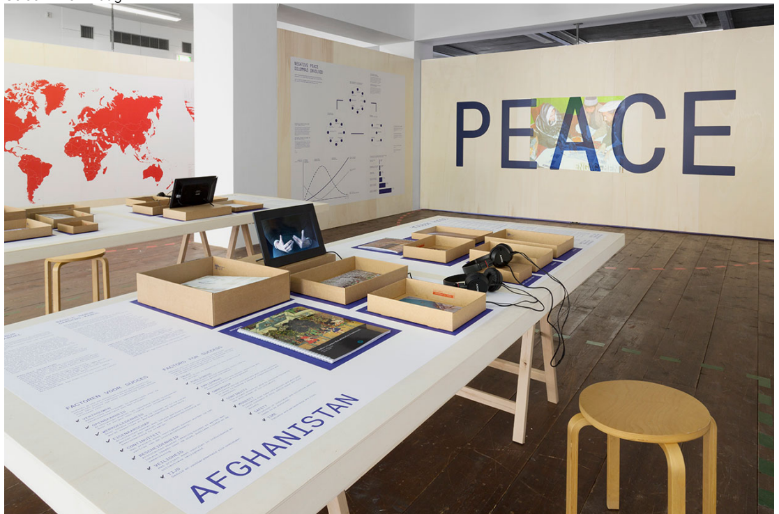
Exhibition pictures 'The Good Cause'.