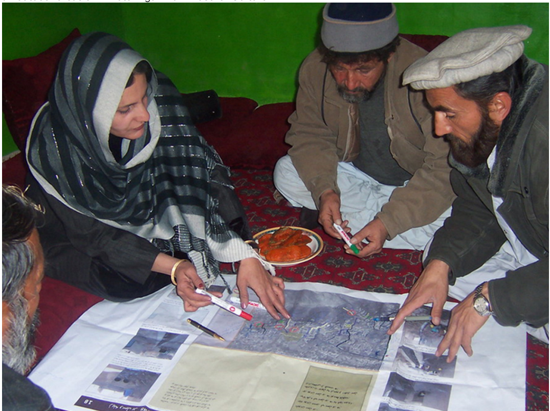
The Good Cause - Architecture of Peace: 'Engagement'.