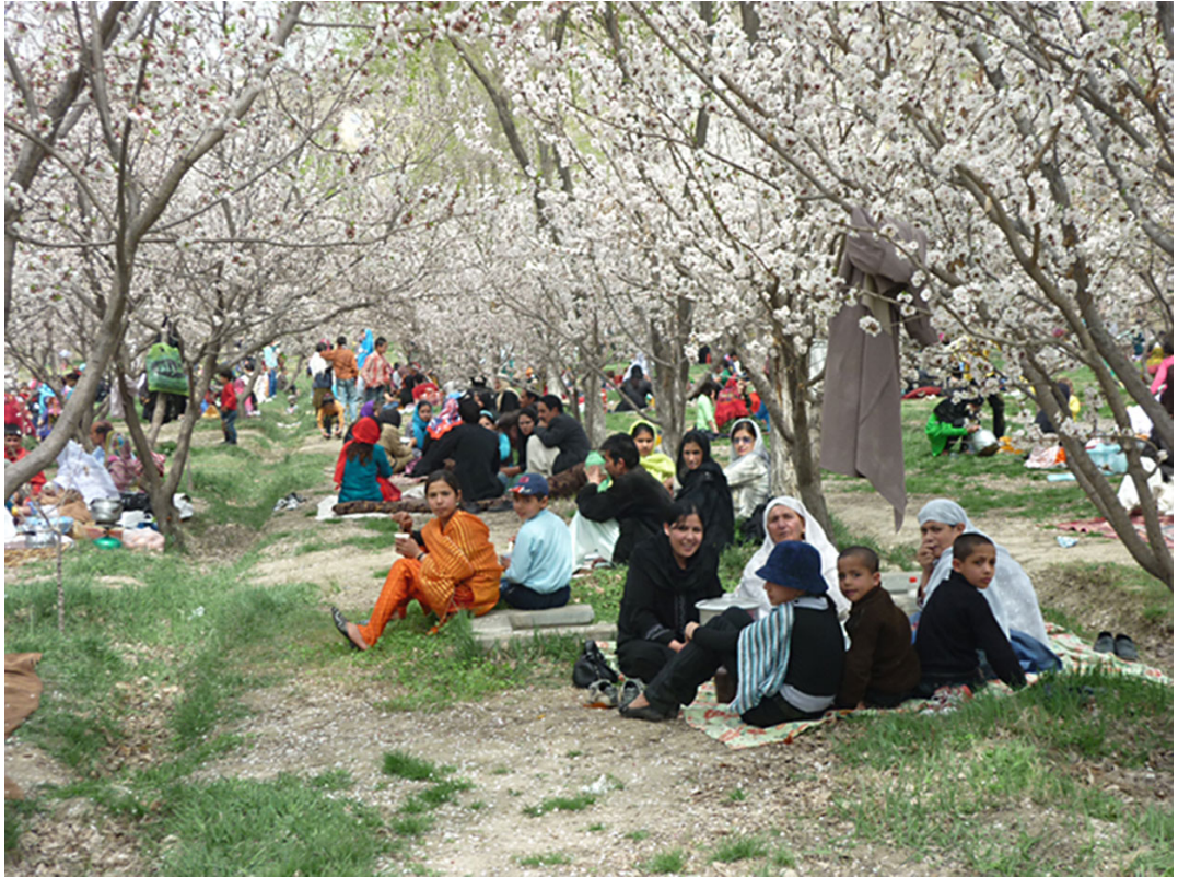
The Good Cause - Architecture of Peace: Babur Gardens.