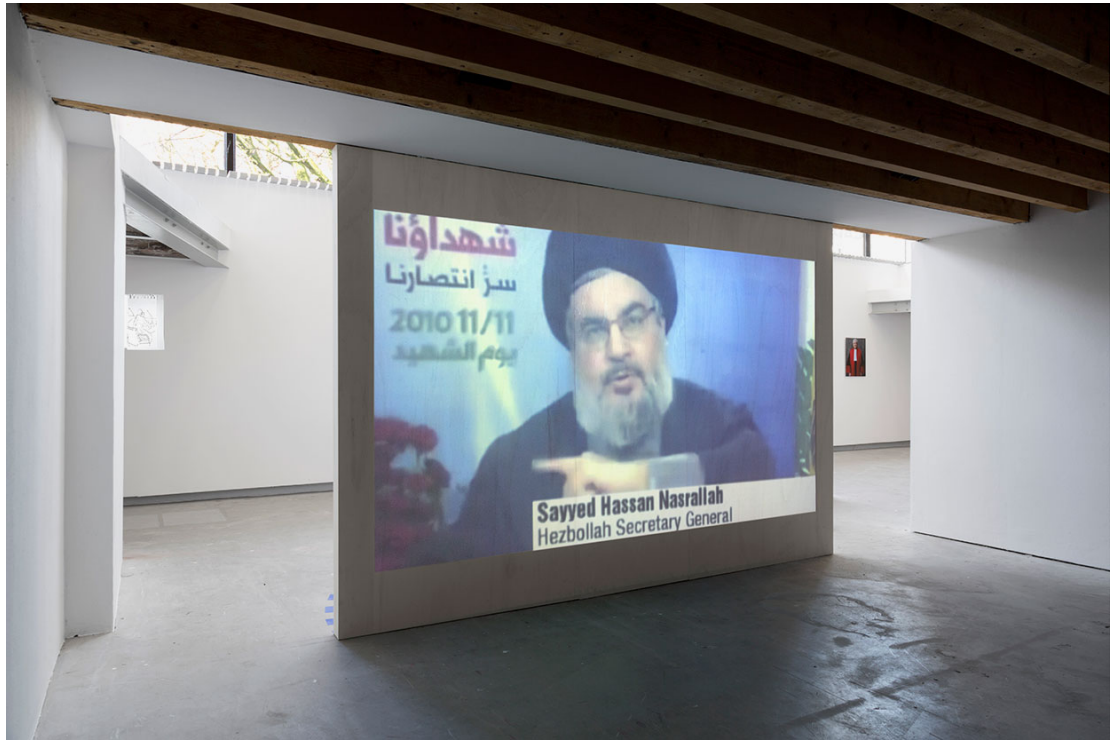
Exhibition pictures 'The Good Cause'.