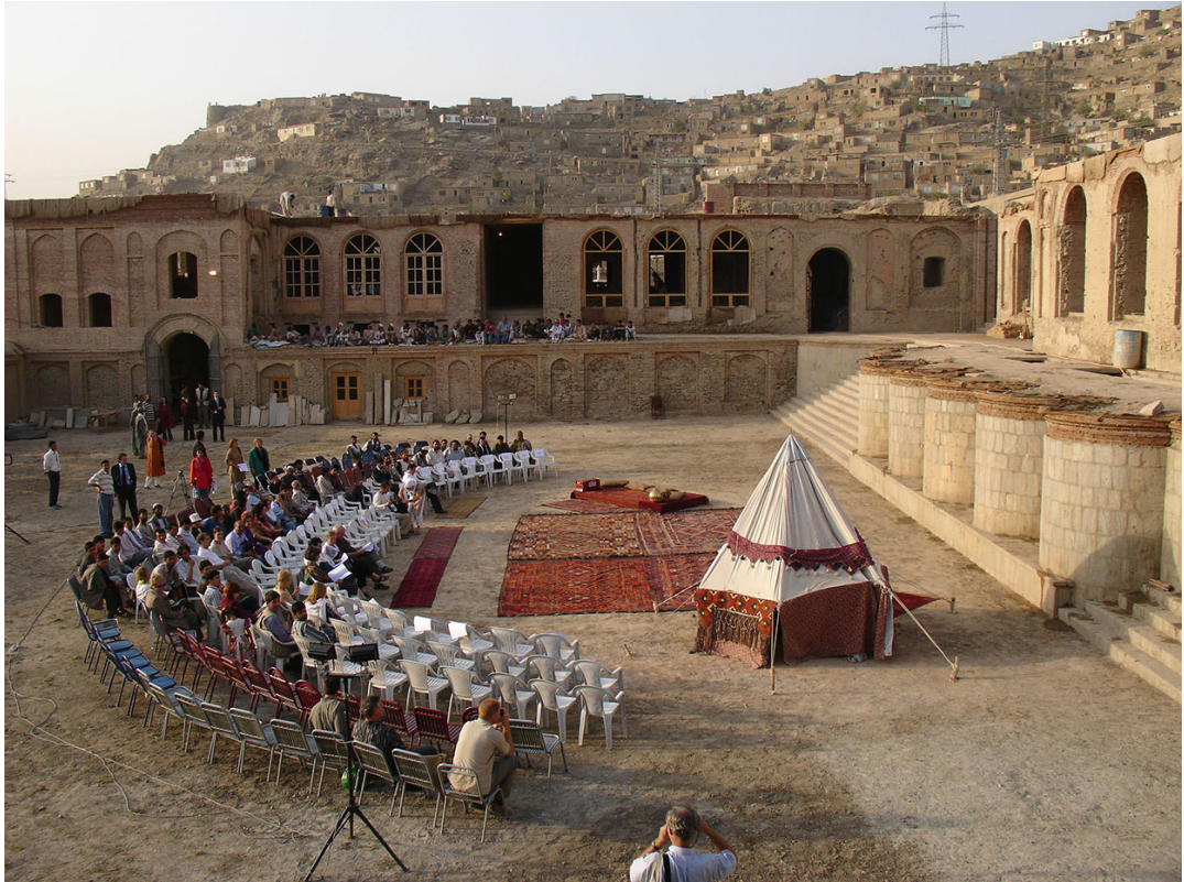
The Good Cause - Architecture of Peace: Queen's Palace rehabilitated into an outdoor theatre.