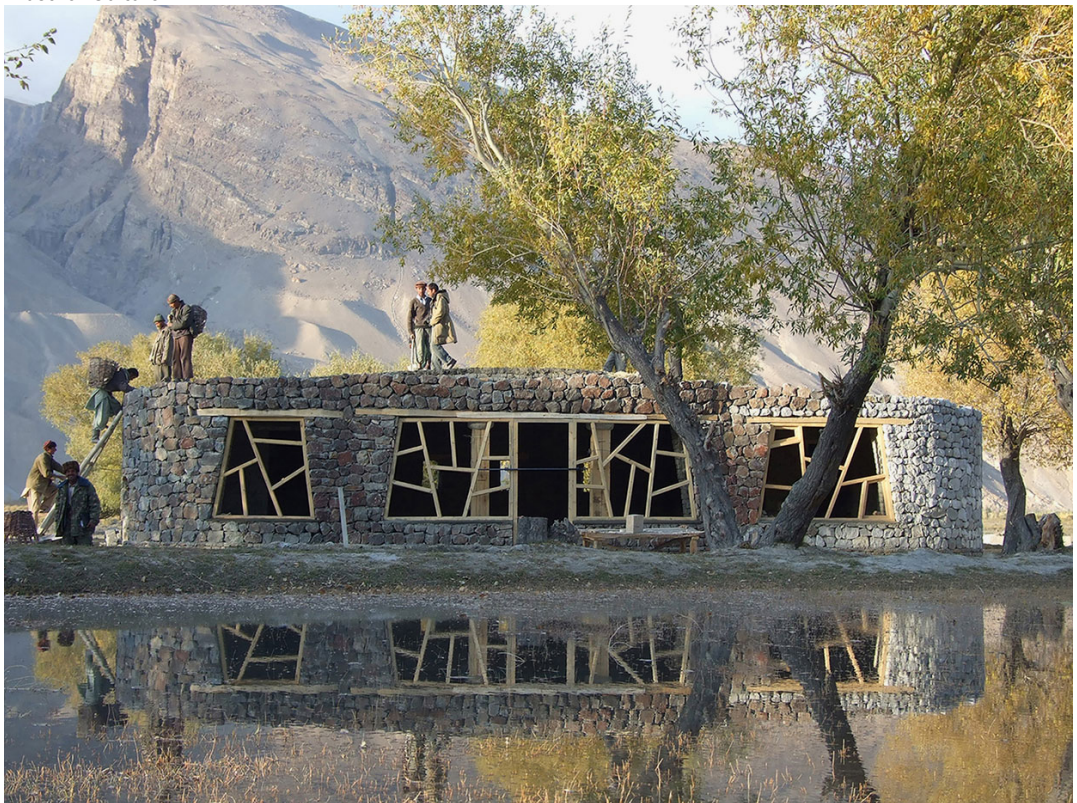
The Good Cause - Architecture of Peace: The facade of the Pamir visitor's centre.