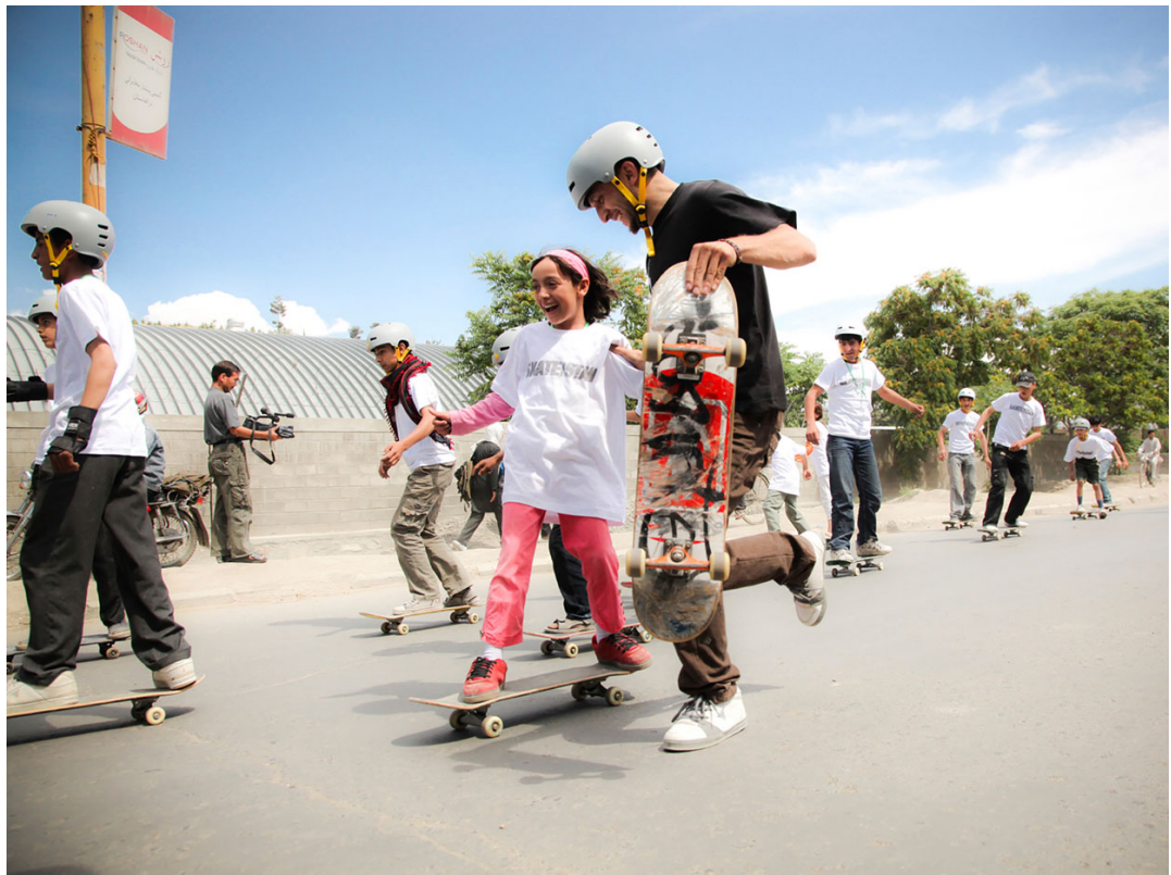
The Good Cause - Architecture of Peace: A Skateistan team out in the streets of Kabul.

The Good Cause at Stroom Den Haag addresses the military, political and cultural complexity of rebuilding operations. Can architecture contribute to a sustainable world peace? Roel Griffioen & Stefaan Vervoort critically question the exhibition and its premises.