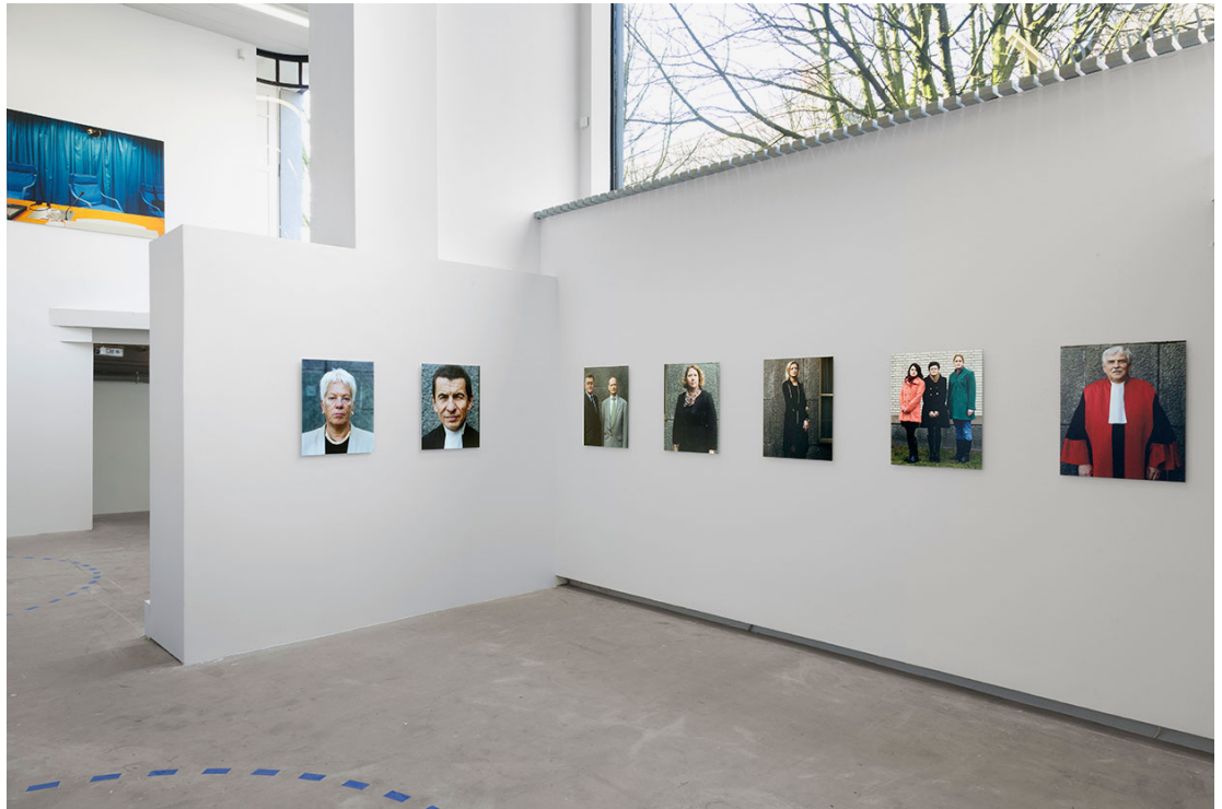
Exhibition pictures 'The Good Cause'.