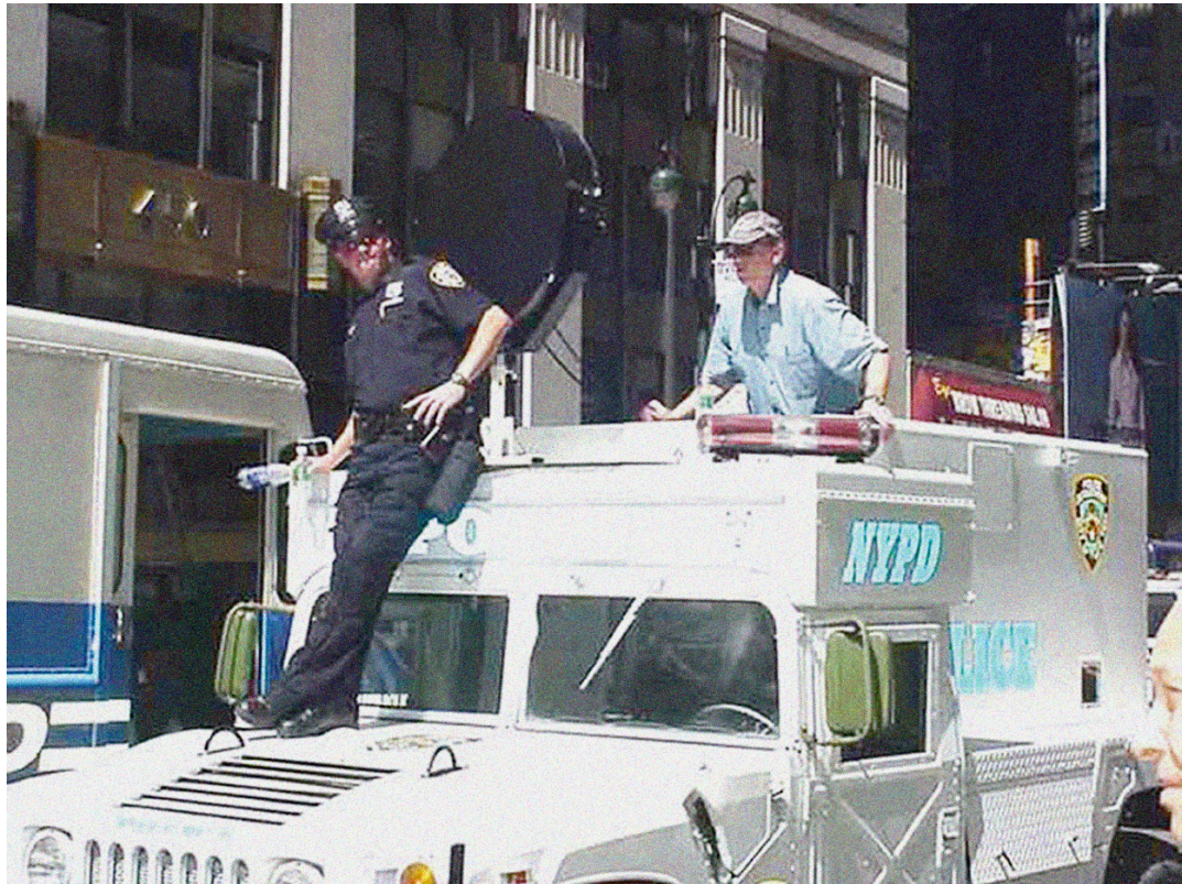
New York Police Department uses LRAD against protesters during Republican Convention, 2004.