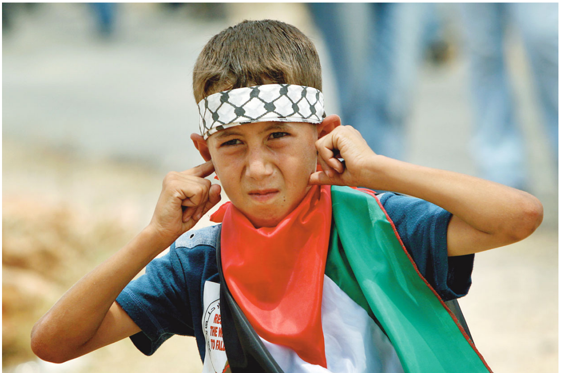
A young Palestinian boy shields his ears in a demonstration of a new weapon, from the article: 'Israel May Use New Weapon on Settlers', AP / Reporter, Friday, 10 June 2005.