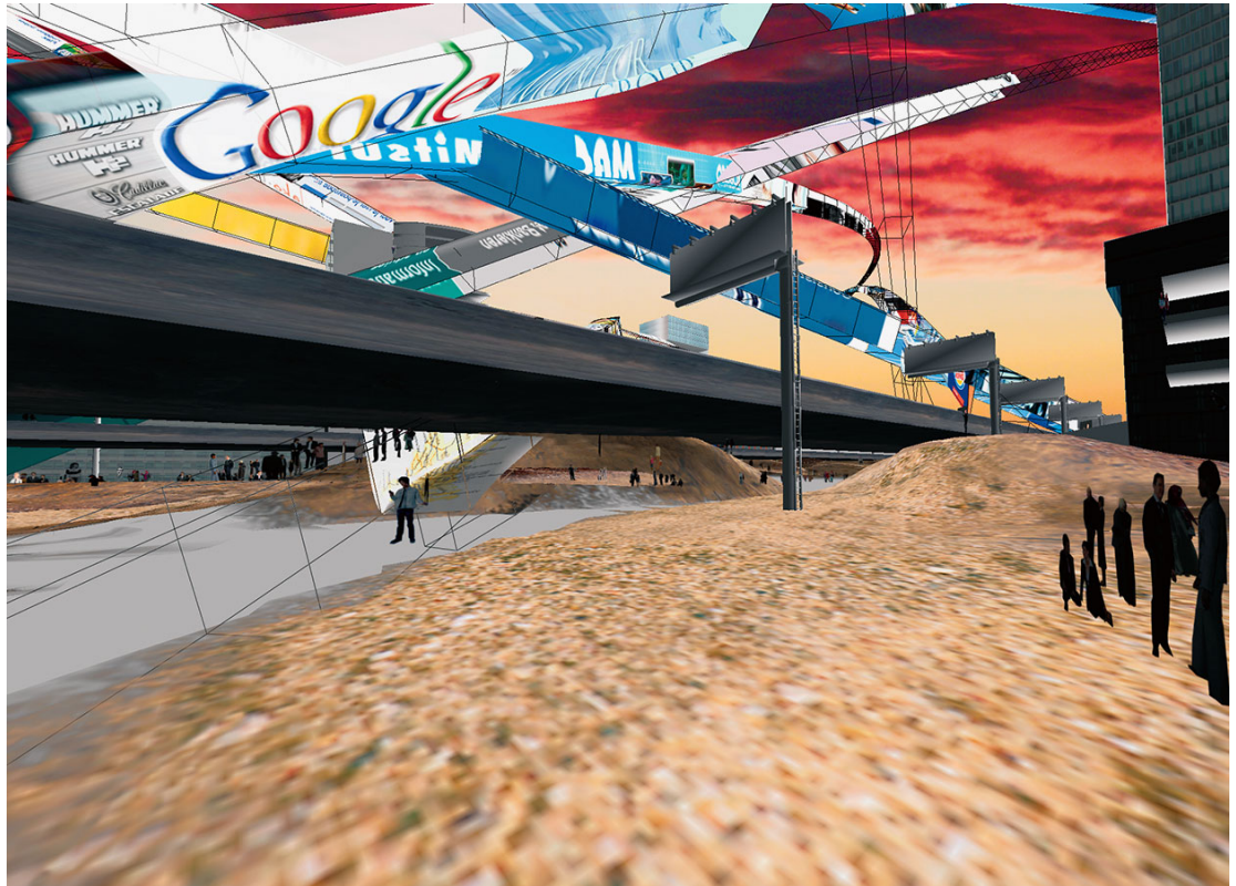
Logo Parc, visualization of the Zuidas research, 2006.

The Zuidas ('South Axis') in Amsterdam is the new economic heart of the Netherlands: no other district has such a high concentration of bankers, accountants, business consultants and attorneys. In the main, two sorts of information are available about what has been built there thus far: promotion and cynical commentary. As regards future developments, castles-in-the-air scenarios and prophecies of doom are making the rounds. Bank skyscrapers have been erected, like the ING House and the headquarters of ABNAmro, and business conglomerate buildings, like 'Vinoly' – more often dubbed 'the corporate crack' because of the painstakingly stylized and lighted fault line that bisects the building's façade – and the 'Ito Tower'. These two buildings, by architects Rafael Vinoly and Toyo Ito, respectively, are part of an urban development called 'Mahler4'. According to the City of Amsterdam's Physical Planning Department, the Zuidas is the ultimate implementation of Berlage's Plan Zuid ('South Plan'), which included a 'highly situated, imposing South Station' with a 'Minerva axis' leading to it. 1