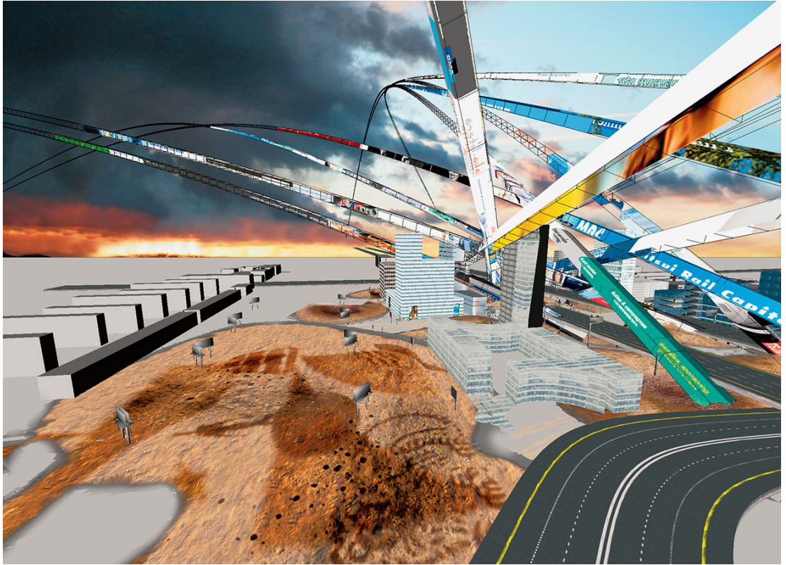
Logo Parc, visualization of the Zuidas research, 2006.