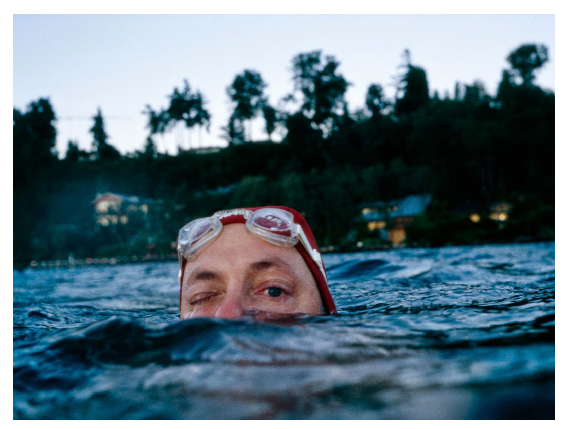
Allan Sekula, Dear Bill Gates, 1999, installation.