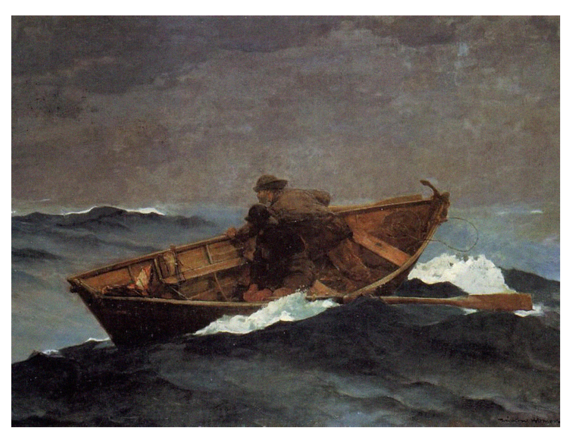
The letter concerns Gates's puchase of the painting Lost on the Grand Banks by Winslow Homer.