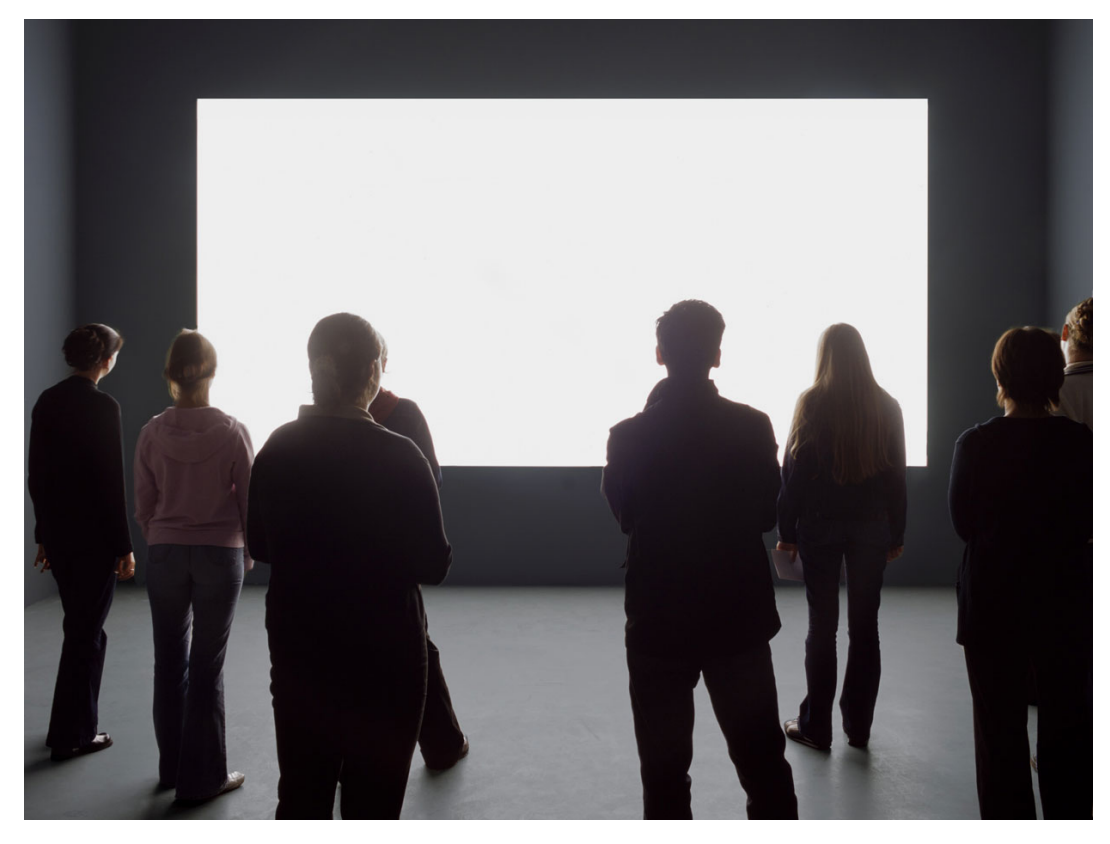
Alfredo Jaar, Lament of the Images, 2002, installation. Three luminous texts in a darkened room; a room with blinding light. © 2012: Alfredo Jaar, New York.

Corbis Corporation, a private company owned by Bill Gates, owns the electronic reproduction rights to more than 80 million images, of which a portion are made available for purchase via www. corbis.com. Corbis also owns a large number of photo archives. In 2001 the company stored millions of original photographs, negatives, prints, and slides in Iron Mountain, a hermetically sealed, underground storage facility in Pennsylvania. Its 'cold storage' stops the chemical deterioration of the images. Is Gates the saviour of the visual memory of the modern era, or a megalomaniac claiming a monopoly over this memory in an unprecedented way? What is the nature of his archive, and what are the implications for art and culture?