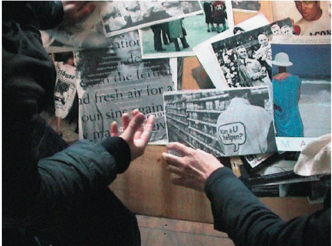
Video stills Bas Medik

What's the 'Archive'? You Say That for Foucault the Archive Is 'Audiovisual'?