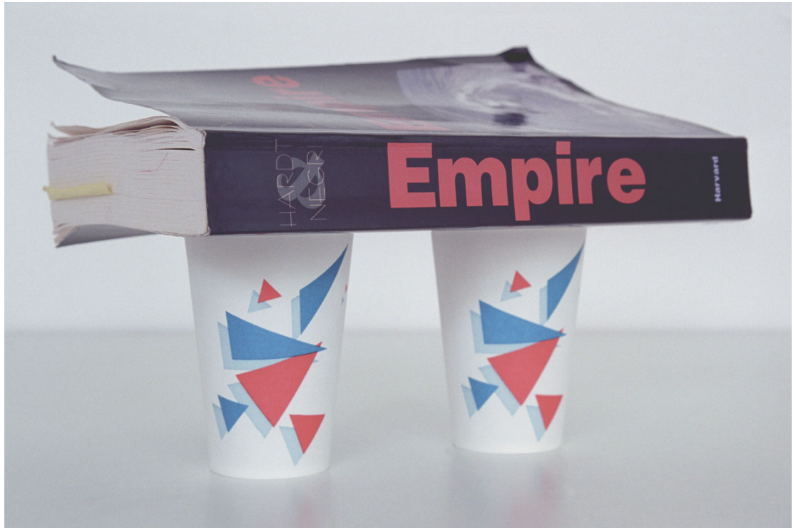
Sealand – Stealth Country (Empire).