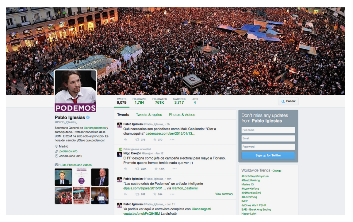
Pablo Iglesias Twitter account.

According to Massumi, the autonomy of affect is "autonomous to the degree to which it escapes confinement in the particular body." <sup>19</sup> In short, it transcends the human body. This, according to the theory, means that, during the transformation of affective forces (unconscious) into flows of emotion (conscious), we experience a considerable loss of intensity. One strategy, with all of its respective virtues and defects, involves the development of the political party Podemos.