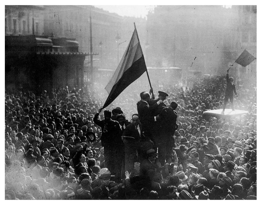
Photograph of The Second Spanish Republic, Puerta del Sol Square in 1931.

In the April 1931 general elections, the Spanish opted for significant political change: the establishment of the Second Republic. <sup>5</sup> Spanish society underwent a notable change that coincided with a period of progress for the autonomous workers movement. The demands for modernisation and socialisation that included agrarian reform, arose mainly in the rural areas and was accompanied by nationalist sentiment.