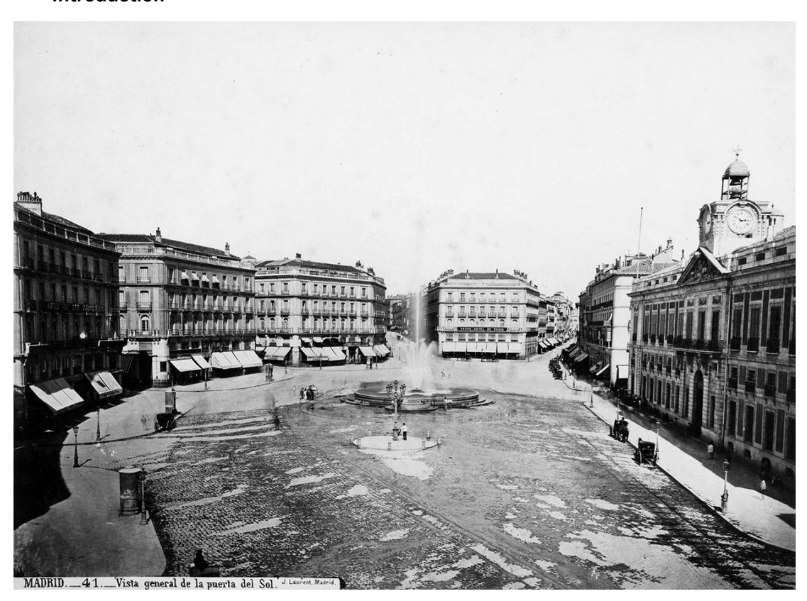
Puerta del Sol Square at the beginning of the 20th century.

Located in the centre of Madrid and, in broader terms, at the geographic heart of Spain, Puerta del Sol Square is a strategic political enclave as has been demonstrated during the history of this country. This square has been, and continues to be, the direct protagonist of a number of events which have changed the lives of Spanish citizens by contributing to their empowerment and the development of a shared identity.