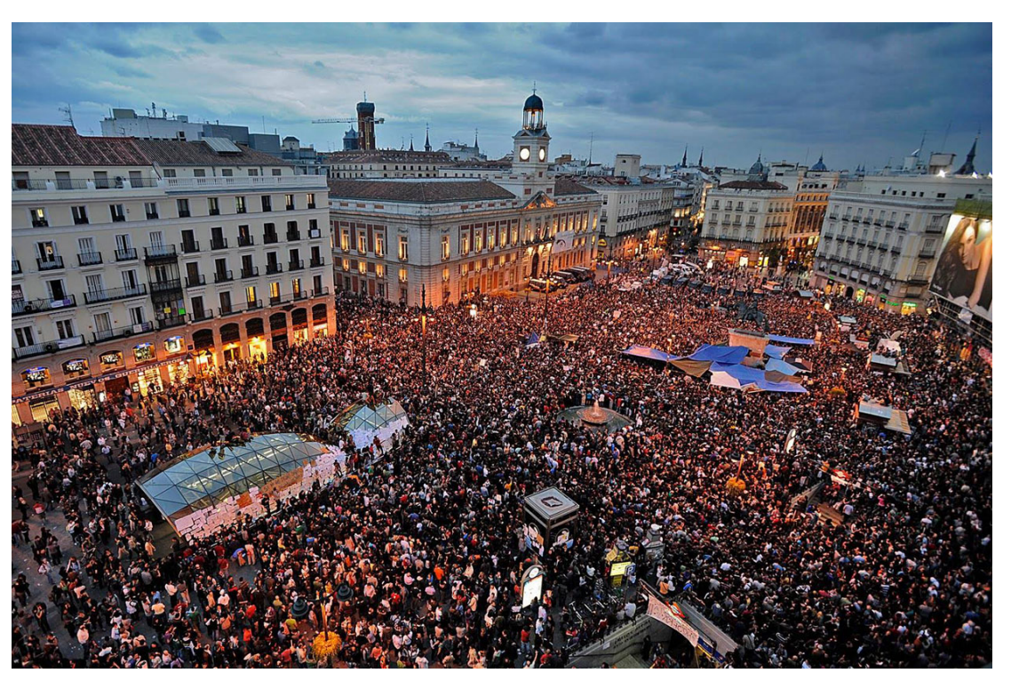
Puerta del Sol Square in 2011, video still.