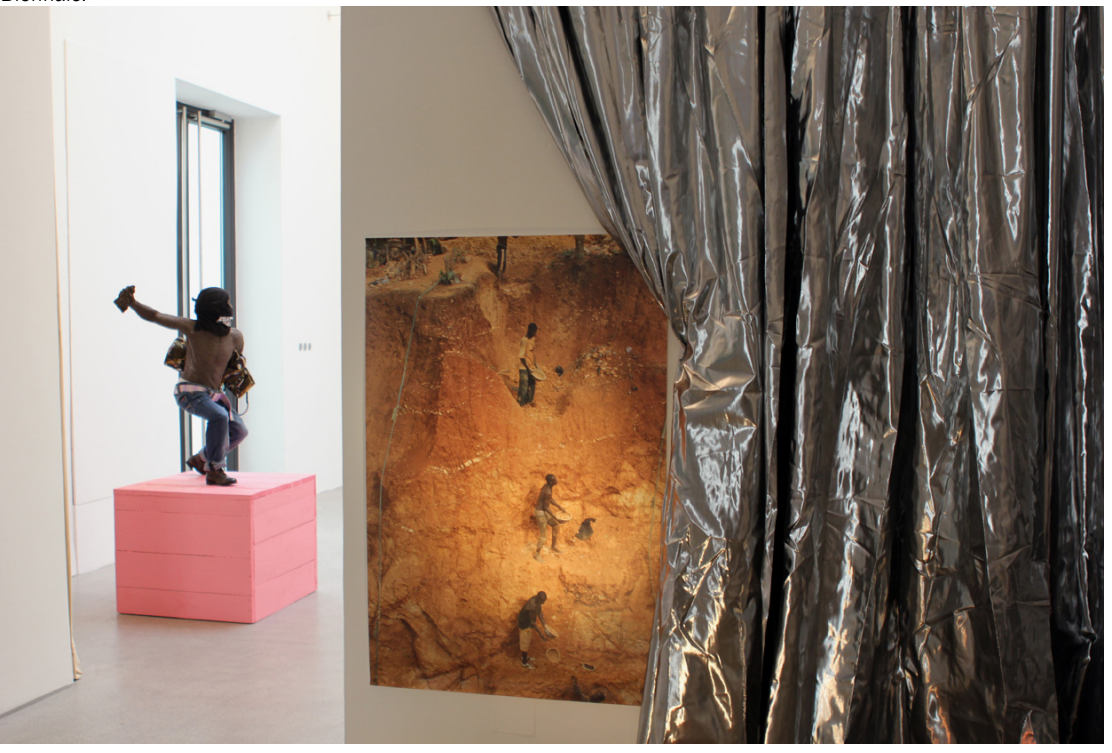
Notes on "Crisis, Currency and Consumption", Vienna, September 2015. Exhibition view with George Osodi, "Ghana Gold - De Money" (2009) and Ines Doujak, "Not Dresses For Conquering, HC 04 Transport" (2015).