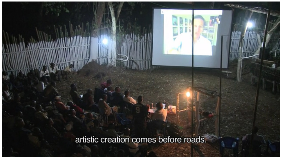
Richard Florida addresses a crowd via Skype at the Institute for Human Activities's opening seminar in June 2012.

In passing, it is worth pointing out here that the idea of artistic labour (or 'creative' labour more generally) as directly productive of value – and therefore worthy of exploitation – is not exceptional at all any longer, but has become rather commonplace. More specifically, I am referring to the widespread enthusiasm concerning the so-called 'creative economy' here, an enthusiasm best exemplified by Richard Florida's book The Rise of the Creative Class (2002) and its follow-ups. As Bernard Stiegler points out, the notion of the creative economy rests above all on the idea (which in itself can hardly be called innovative) that value and wealth are generated from ideas more than anything else. 20 In this discourse, however, 'creativity' generally tends to be considered an incredibly open signifier. Martha Rosler, for instance, has pointed out that what Florida has labelled the 'creative class' makes up about thirty percent of the workforce in the US – which gives the Floridas of this world plenty of opportunities to cook their books. 21 While it would be interesting to examine in more detail how the idea of the creative economy relates to art's alchemical creation of value, I will now keep my focus on the art world, which is only one segment of what Florida, in all apparent earnestness, calls the 'super creative core' of the creative class.