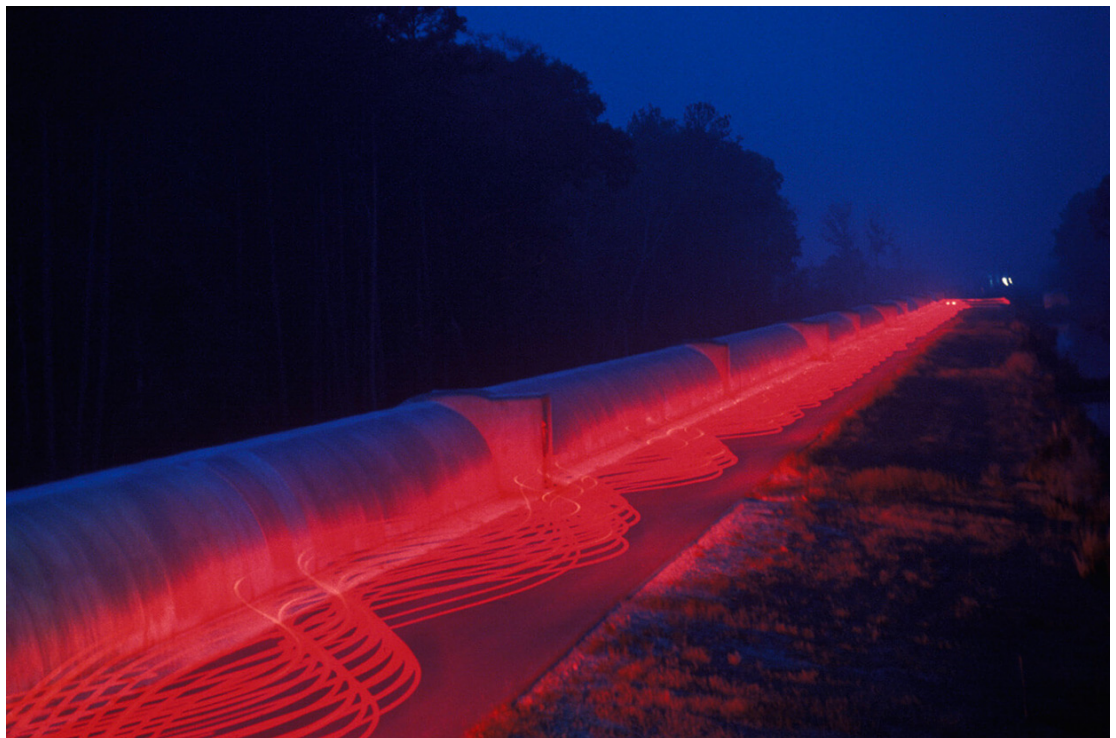
A time-exposure representation of the Laser Interferometer Gravitational-Wave Observatory (LIGO), in Livingston, Louisiana