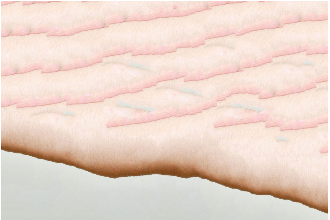
All images by Federico Antonini

The Cloud, and those who live in it like 0001, can introduce us to algorithms that allow us to exist as a whole. This algorithmic process of becoming sees the whole as not merely the end but the means to it. In the Cloud, it is possible that we are always already whole, and that there we find our desires are not ours alone. ‘Cloud_0001’ is part of the Open! COOP Academy series Between and Beyond [ onlineopen.org/between-and-beyond ].