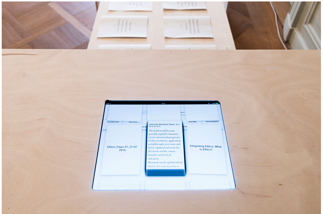
Asya Sukhorukova and Lin Ven

Asya Sukhorukova and Lin Ven investigated the distribution of pamphlets as political commentary that occurred during the so-called “pamphlet wars” in the Netherlands in the eighteenth century and how they can be compared to the public disputes that take place in the comment sections of today’s social media channels. Declaring Word critically reflects on the ease and lack of concern that citizens have for public commentary. It seems that, unlike in the past, written self-expression is now much more easily published without the actual necessity to take moral responsibility.