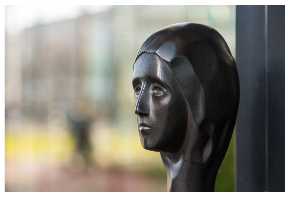
Portrait of a Recipient as a Door Handle, After a drawing produced by an anonymous philanthropist, installed at Rabobank, Blaak 333, Rotterdam, 2014, commissioned by Sculpture International Rotterdam.