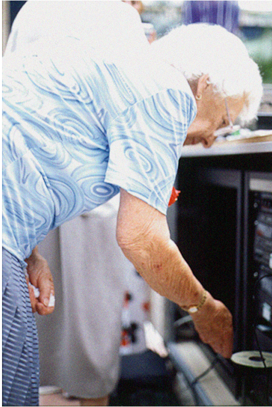
An Invitation to Dance.