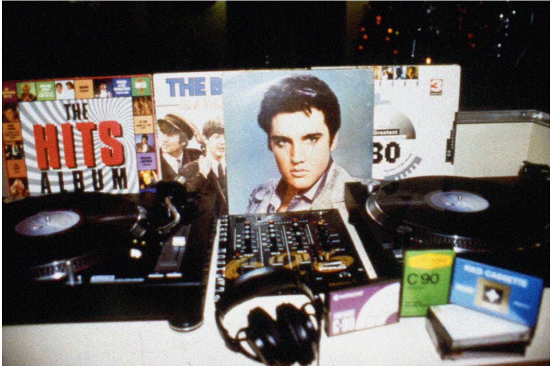
Bingo club pensioners christmas party.