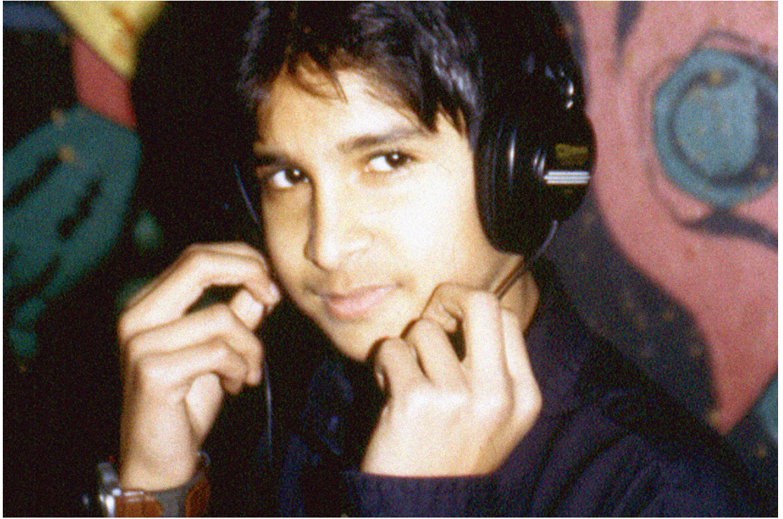
Saturday Club Christmas Party.