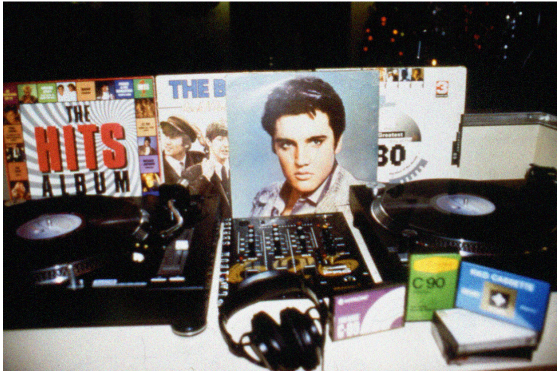
Bingo club pensioners christmas party.

Berry, Russ Conway and old East End pub songs of which they knew all the lyrics. They were a very lively group and the floor was full of couples dancing romantically together. Lesley got the pensioners into the singing mood by taking the microphone to their tables and encouraging them to sing along. Most sang with great pleasure and confidence. They finished the night with some more contemporary tunes by artists such as Britney Spears, Steps and Geri Halliwell.