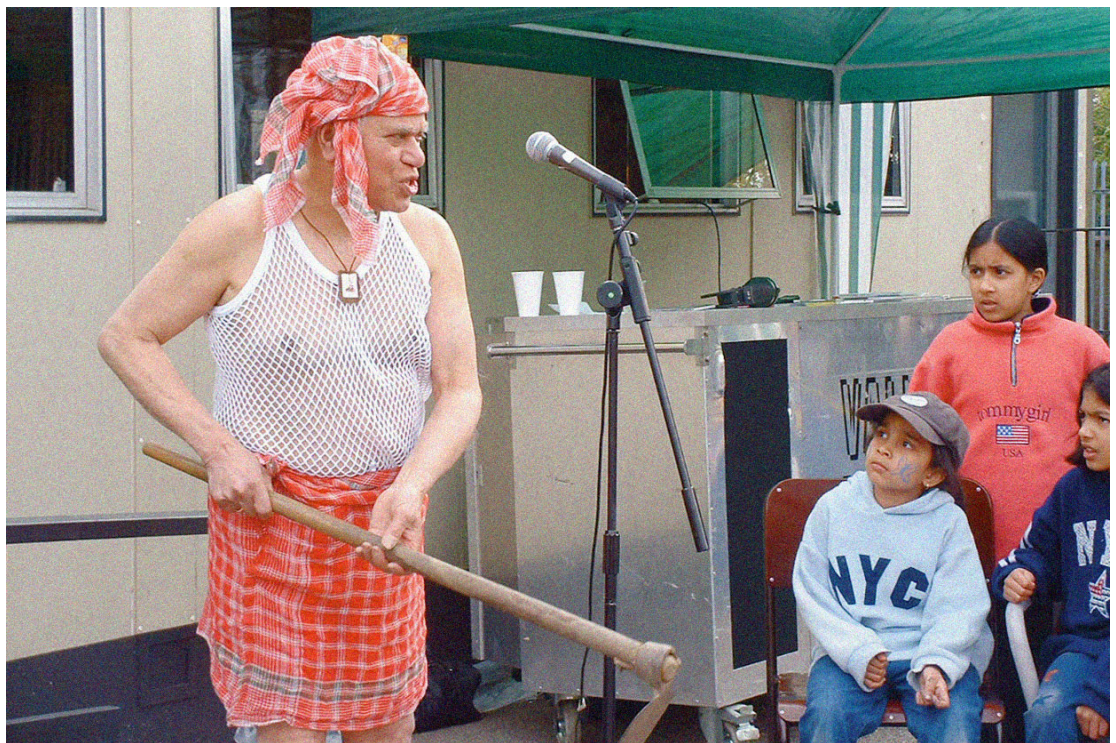
Goan Community Open Day.