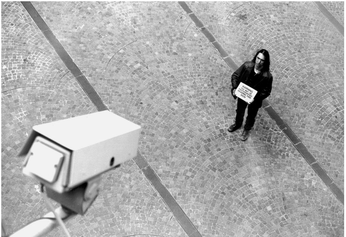
Denis Beaubois, Amnesia performance, Sydney, 1996

Based on the work of artists such as the Australian Denis Beaubois (1970), Thomas Y. Levin analyses the significance and the effect of the ever-expanding system of surveillance cameras in the public space. Through performances in the public space, Beaubois plays a game with security devices. In this way he has developed a strategy for turning the panoptic effect of security and surveillance by means of cameras and facial recognition software back upon itself.