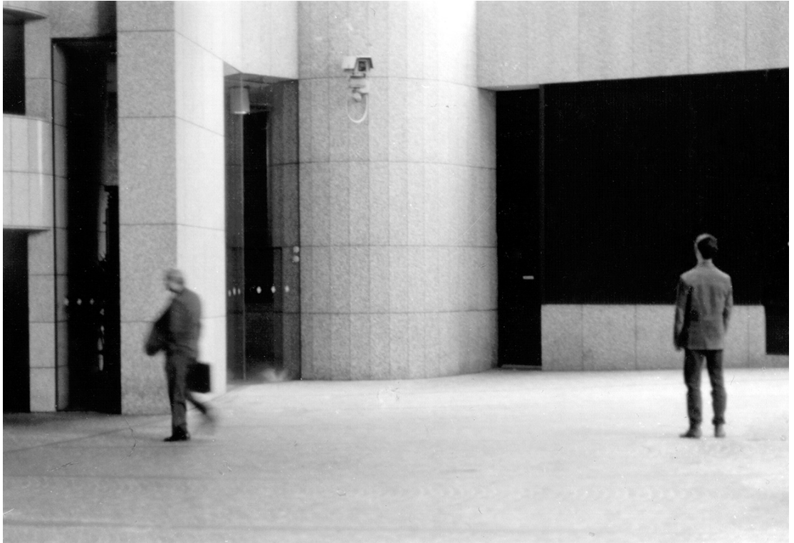
Denis Beaubois, Amnesia performance, Sydney, 1996