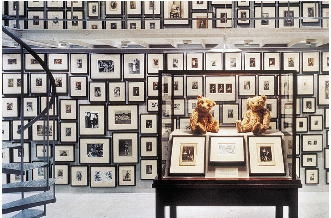
Ydessa Hendeles, Partners (The Teddy Bear Project) , 2002. Installation at the Haus der Kunst, Munich.

In last year's exhibition 'Partners' at the Haus der Kunst in Munich the Canadian curator and collector Ydessa Hendeles broke the tacit laws of Holocaust memorials. Grouping objects of different natures and placing them in a single context, created all manner of fascinating cross-connections among the objects and with the building, laden by the Nazi past.