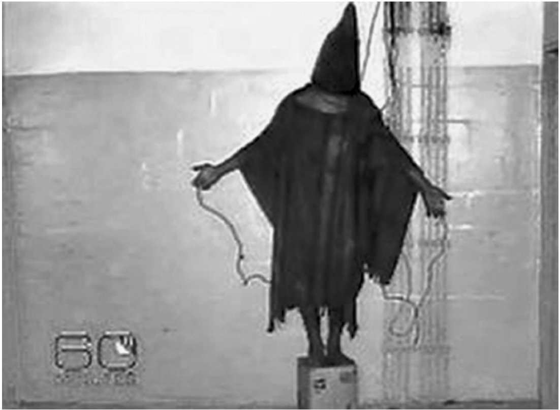
Torture of Iraqi prisoners by American soldiers in the Abu Ghraib prison, Irak, late 2003.