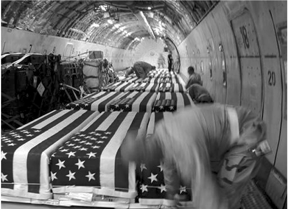
Photograph taken by Tami Silicio of the coffins of American soldiers in a freight airplane at Kuwait International Airport, 7 April 2004.

Photos of coffins cost amateur photographer Tami Silicio her job – she worked for a transport company in Kuwait that is responsible for the transportation of human remains. And it is not improbable that the American military will be formally forbidden to take photographs or videos when ‘on duty’. However, it is ultimately difficult to impose such a ban on images, or the restrictions that ‘embedded journalists’ and photojournalists are subject to, on ‘the amateur’ in general: that could, indeed, be anyone, and they could be anywhere and everywhere, at all times. And with the Internet they certainly have a publication and distribution medium available to them with an unprecedented public dimension.