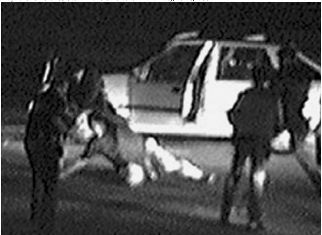
Amateur video of the beating of Rodney King by American policemen, Los Angeles, 1991.

Photos of the torture of Abu Ghraib prisoners in Iraq were first made public in America in April 2004 via CBS's 60 Minutes and The New Yorker , and then spread quick as lightning around the globe via the Internet and other news media. 1 Less than five months later, a selection of the images was featured in the 'Inconvenient Evidence' exhibition at the International Center of Photography (ICP) in New York and the Warhol Museum in Pittsburgh. 2 The digital photos were printed directly from the Internet and pinned 'raw' to the walls. 'Inconvenient Evidence' was organized by the critic, writer and curator Brian