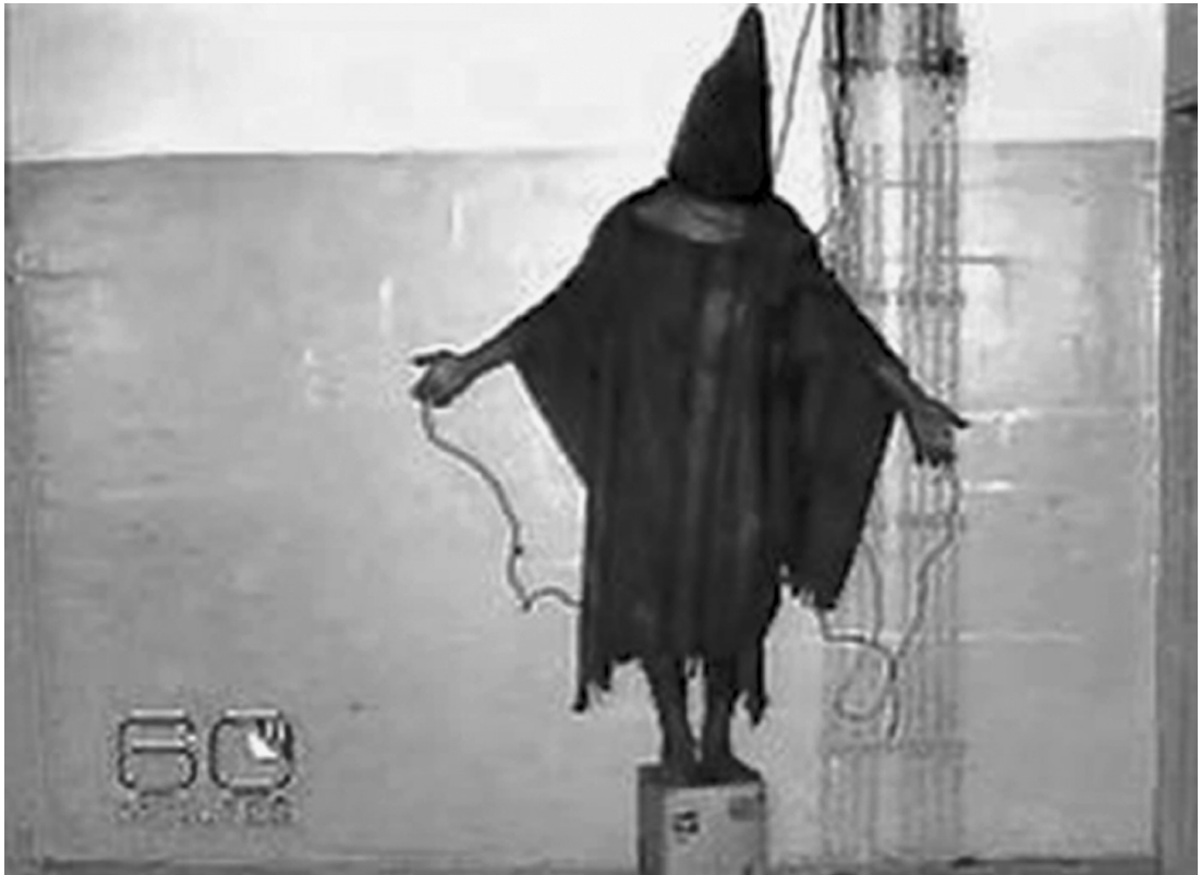
Torture of Iraqi prisoners by American soldiers in the Abu Ghraib prison, Irak, late 2003.