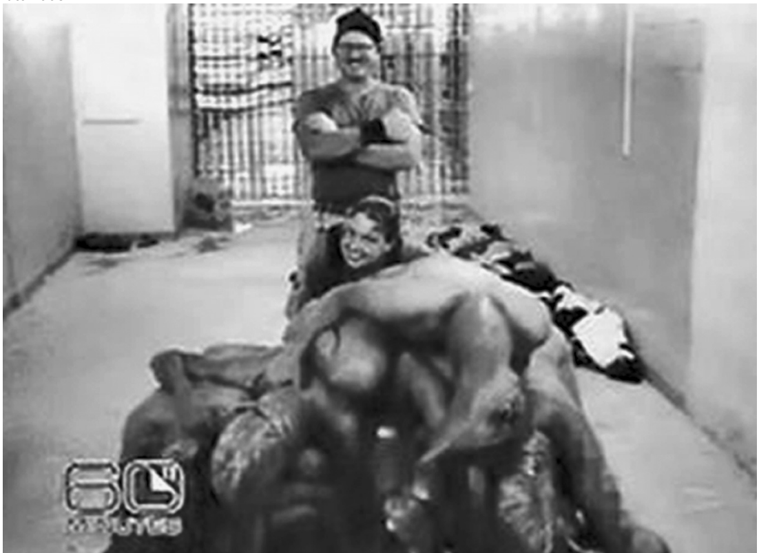
Torture of Iraqi prisoners by American soldiers in the Abu Ghraib prison, Irak, late 2003.