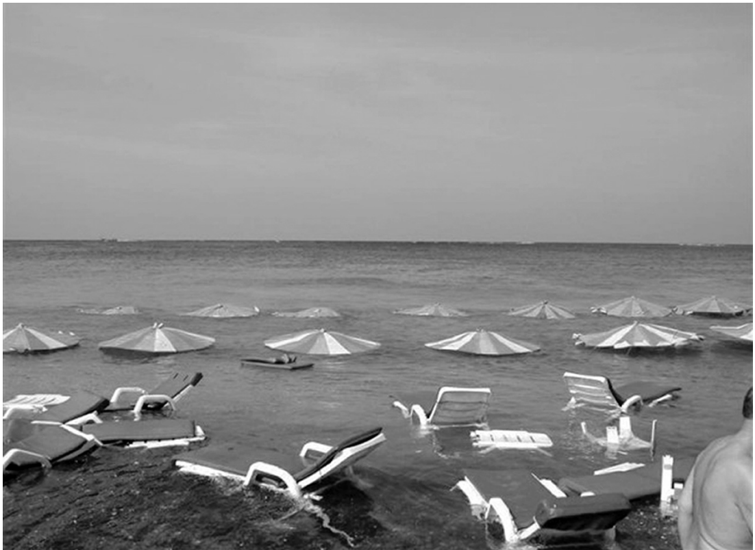
Amateur photo of the tsunami in Southeast Asia, posted on the internet, 2004.

There is nothing new in camera images shot by amateurs being able to play a role as evidence and as a visual resource in the reporting and interpretation of significant events – witness the Zapruder film of the assassination of J.F. Kennedy or the Rodney King video tape. Now, however, digital media and the Internet seem to make an increasing intrusion of amateur images in the professional media inevitable. What is the status of these ‘wild’ images in the public domain? Do they reveal the new blind spots of the official news media? Or do they primarily demonstrate a public desire for images that almost eradicate the distance from events?