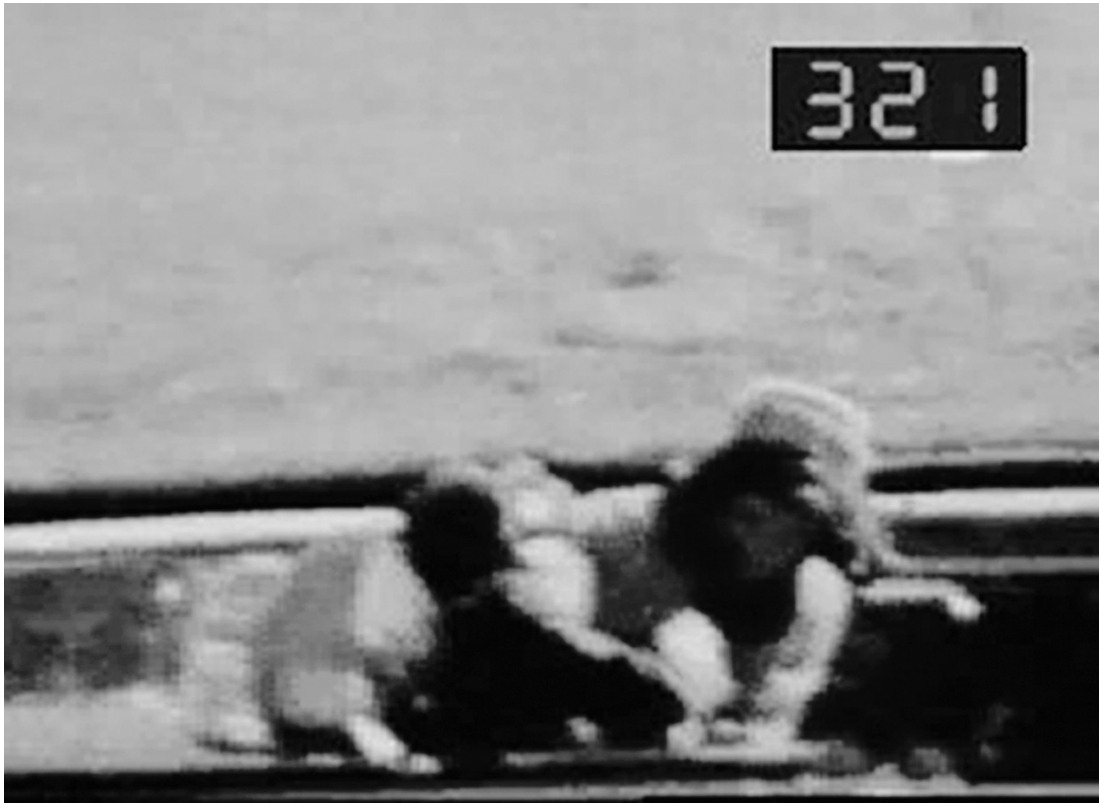
Fragment from the Zapruder film of the murder of J.F. Kennedy, Dallas, 1963.