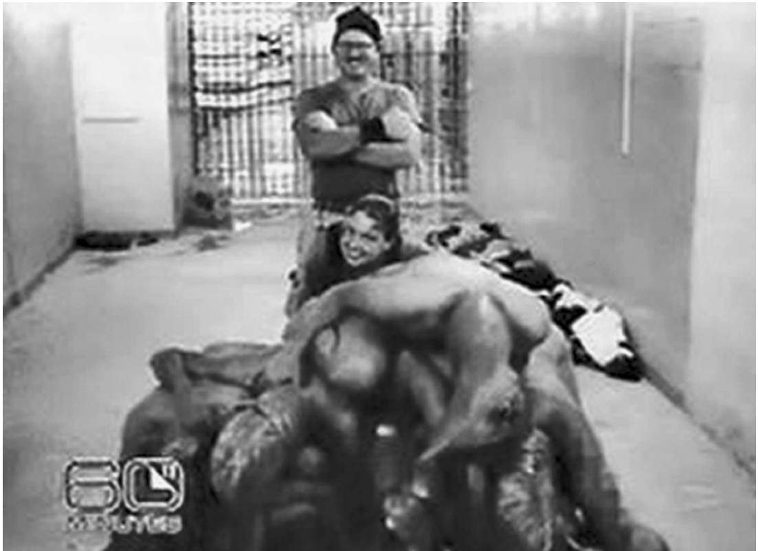
Torture of Iraqi prisoners by American soldiers in the Abu Ghraib prison, Irak, late 2003.