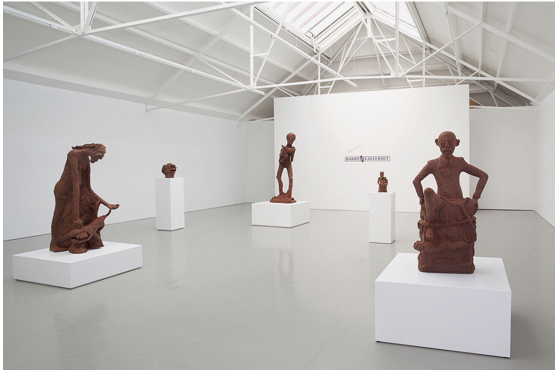
Chocolate sculptures of The Institute of Human Activities (IHA) at Fons Welters.

Although the Congolese participants Martens employs benefit from these projects, it is the western museums who, according to Martens' own vicious analysis, benefit the most. So, he not only managed to parody the good intentions of the critic-activist artist, including himself, but he also managed to reveal the multi-layered and difficult to ignore the dependent relationship within the global financial circuit, which, on the one hand, finances art projects and, on the other, maintains a firm grip over them. Martens asked who ultimately benefits from these good intentions? After all, good intentions are immediately co-opted by the economic political system of which activist artists are an irreplaceable part.