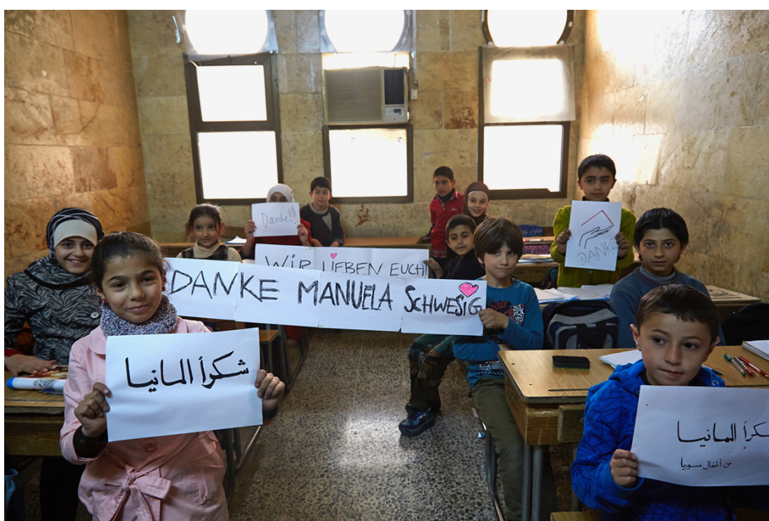
Zentrum für Politische Schönheit, Die Kindertransporthilfe des Bundes.

All of the artist initiatives presented at the conference have their own political and social agendas. Despite this common ground, it didn't take long before a dilemma arose that cut through the debates like a knife: Should political or activist art have a practical social impact and literally interfere in everyday reality, or should it concern itself with a symbolic-critical practice that aims to expose deeper layers of awareness and understanding? This crucial question arose after the Zentrum für politische Schönheit (ZPS) made its presentation and thereafter became the dominant question. The ZPS's presentation of its Kindertransport project, which refers to the 1938 transport of 9354 Jewish children from Germany to England, is an appeal to the German people to offer asylum to an equal number of Syrian refugee children. The project combines visual interventions that refer to the Second World War and political actions that offer concrete results in the form of asylum for many Syrian children. These activities are combined with images that offer commentary that can be construed as ironic: for example, an image of happy Syrian children who thank the German Minister of Family Affairs Manuela Schwesig. 11