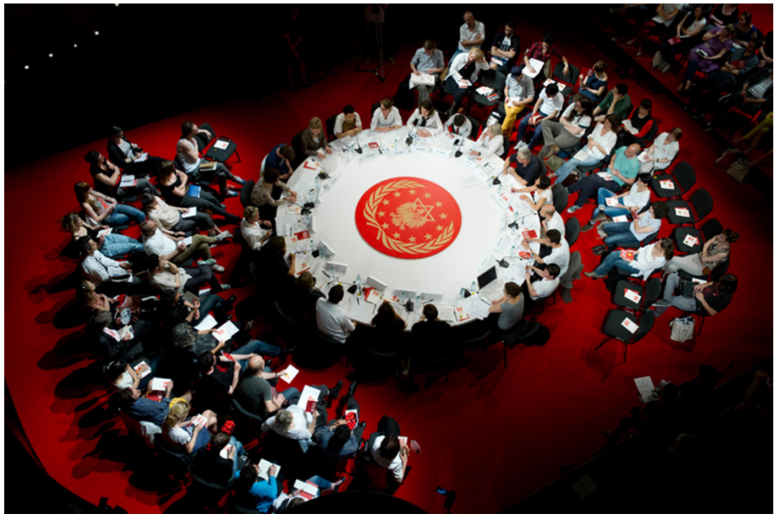
Yael Bartana, 7th Berlin Biennale, 'And Europe will be stunned', First international congress of the Jewish Renaissance Movement in Poland.

the past that allows you to relate to the original event in a new way. This strategy was used by Yael Bartana's Jewish Renaissance Movement In Poland (JRMiP) and in the Institute of Political Murder's re-enactment of old tribunals. In both cases people are seen working with fictional and theatrical elements in a staging that positions itself as being real, with the aim of questioning reality as a fictional, constructed reality. The JRMiP effectively represents how propagandistic elements within the arts can be used to question the inevitable mingling of fact and fiction (Žižek 2006). The JRMiP is a fictional movement; its members are played by actors and it has a fictional leader and a fictional logo. Fictional events are re-enacted in order to realise a fictional goal: the return of the Jews to Poland. However, what's happening within this movement is not only based on historical fact, but might actually be real or may become reality. This kind of movement can be formed fairly easily and can be used to encourage Polish Jews to return to Poland, their country of origin.