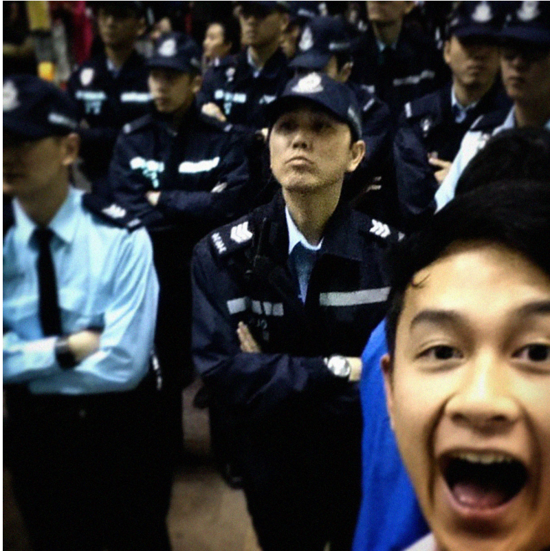
Image 8: The police officers were not very impressed. #hongkongprotest #idonotcare