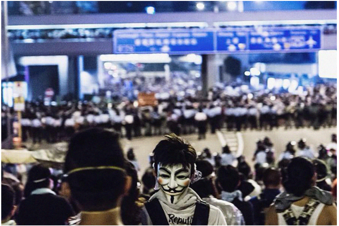
Image 5: #umbrellarevolution #hongkong #standupforhk #theworldiswatching #occupycentral #occupyhongkong #928 #democracy #supporthk