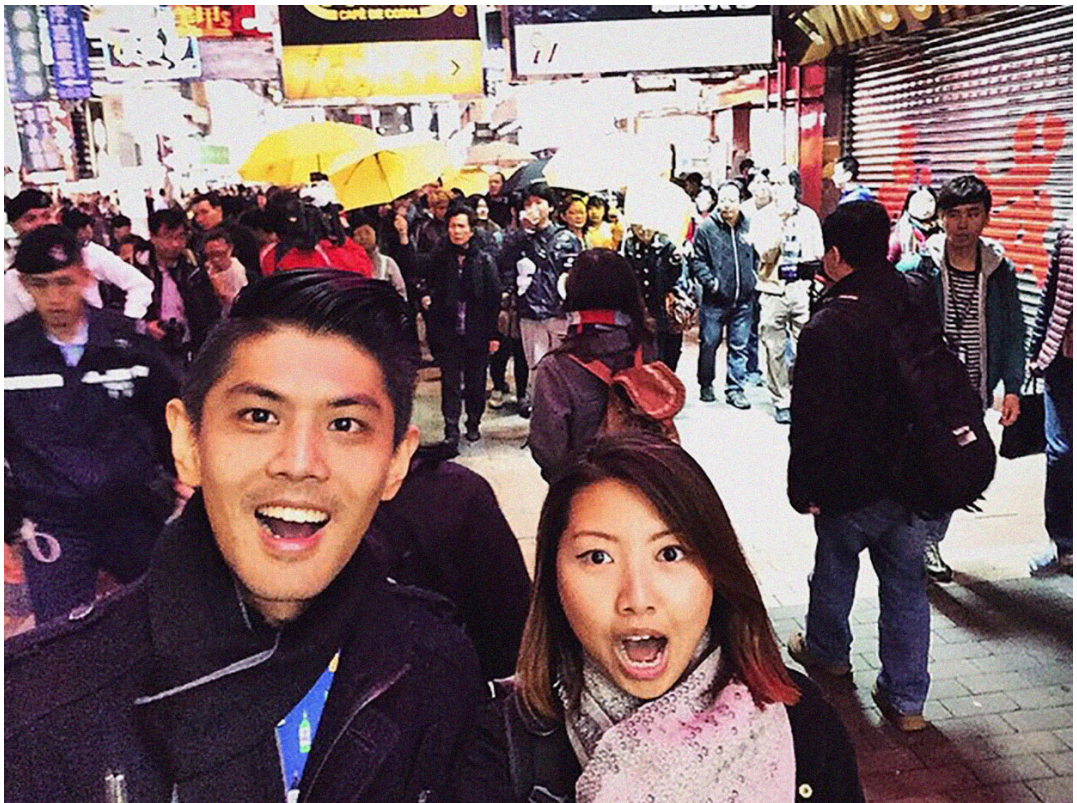
Image 9: Surrounded by protesters behind us, police in front of us, and reporters beside us. #hongkongprotests #butfirstletmetakeaselfie #yellowumbarellarevolution

Two sets of photographs above (images 6, 7, 8 and 9) have a similar shooting strategy. The key point here is whether the act of shooting is happening simultaneously with the protest, i.e., in the same space and time. We can see from the first set that the person