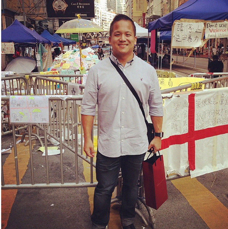
Image 2: #admiralty #protests #protestorsite #hongkong #occupycentral #umbrellarevolution #hongkongprotests #igers #selfie #selfiewanker #photooftheday

movement, wearing his exquisite Guy Fawkes mask, we can easily recognize that he wants to be a participant in the event. Somehow the way my friend had himself photographed kept on confusing me. Then I realized that it had been quite some time since I had seen these kinds of images during my daily usage of social networks like Instagram. Somehow, the style of my friend's photograph is sort of anachronistic, it reminds me of the old-fashioned mode of taking self-portraits, albeit within the past few years. There are still quite a number of similar ones on Instagram.