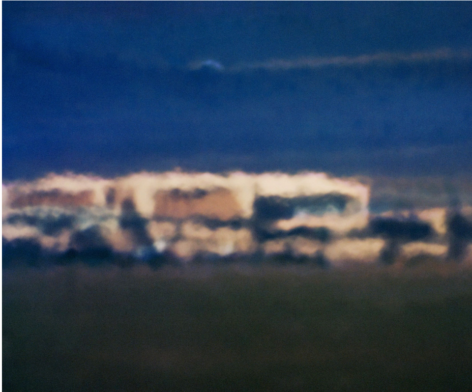
Figure 3: Trevor Paglen, Open Hangar, Cactus Flats, NV, Distance 18 miles, 10:04 am, C-Print, 2007.

Limit Telephotography (2005–2007) also presents us with an open secret and, therefore, a cognitive fissure that opens the way for aesthetic and affective concerns. This set of photographs of secret military bases shows us Paglen asking himself how he can make visible that which institutionally and physically resists technologies of representation. This is both a technological-practical, as well as an aesthetic question.