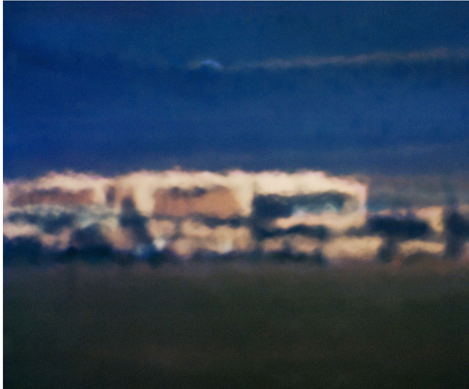
Figure 3: Trevor Paglen, Open Hangar, Cactus Flats, NV, Distance 18 miles, 10:04 am, C-Print, 2007.

Limit Telephotography (2005–2007) also presents us with an open secret and, therefore, a cognitive fissure that opens the way for aesthetic and affective concerns. This set of photographs of secret military bases shows us Paglen asking himself how he can make visible that which institutionally and physically resists technologies of representation. This is both a technological-practical, as well as an aesthetic question.