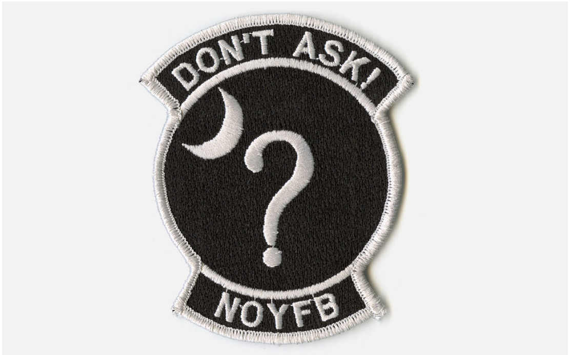
Figure 2: Trevor Paglen, NOYFB , patch, 2006. Courtesy the artist, Altman Siegel, Metro Pictures and Galerie Thomas Zander.

There is a similar logic at work in NOYFB (fig. 2), an insignia from the 22nd Military Airlift Squadron, “which flew c-5 cargo aircraft out of Travis Air Force Base in Northern California.” 30 Rubbing against the warning, NOYFB (an acronym obviously for “none of your fucking business”), the punctuation in the centre posits the secret operation as a mystery. While the question mark invites us to approach the patch as a hermeneutic problem, the patch as a whole points to the limits of interpretation.