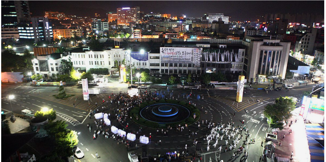
Spring, aerial view of the May 18 Democratic Square, 2008. – Photo: Cheolhong Mo, image courtesy Gwangju Biennale Foundation

future, an unprecedented majority of voices should form images and imagine forms of governance. Should that fail, the rhetoric – let alone the practice of art- and exhibition-making even under the state of exception created by the biennial context – is under suspicion of a collusion with power. In closing, in response to your question, voices were masked and images hushed through the various processes of distancing or flight, encoding or hiding.