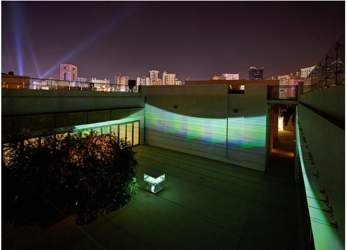
Caline Aoun, Time Travel , 2019.

Your scholarship draws from art historical and cultural studies of performance, performing arts, and citizen movement and organization. All of these have been shaped and inflected by dominant Euro-American discourses and postcolonial and decolonial thinking and action. The hegemon remains as the most concrete fold and vector to engage with. Could you speak more about the emphasis on the 'after -' (after-images, after-forms) and other prefixes such as 'de -' and 're-' (dispossessive and repossessive disposition) as your ethico-political position, which seems to be a lateral move from the familiar tools of deconstruction, such as the project of 'counter-' (counter-images, counter-narratives, counter-mapping)? Perhaps you could also elaborate on how this interplay of directions emerge in the works of artists in the biennial?