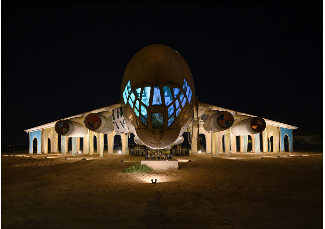
New Orleans Airlift, The Trans-National , 2019, abandoned airplane site, Umm Al Quwain.