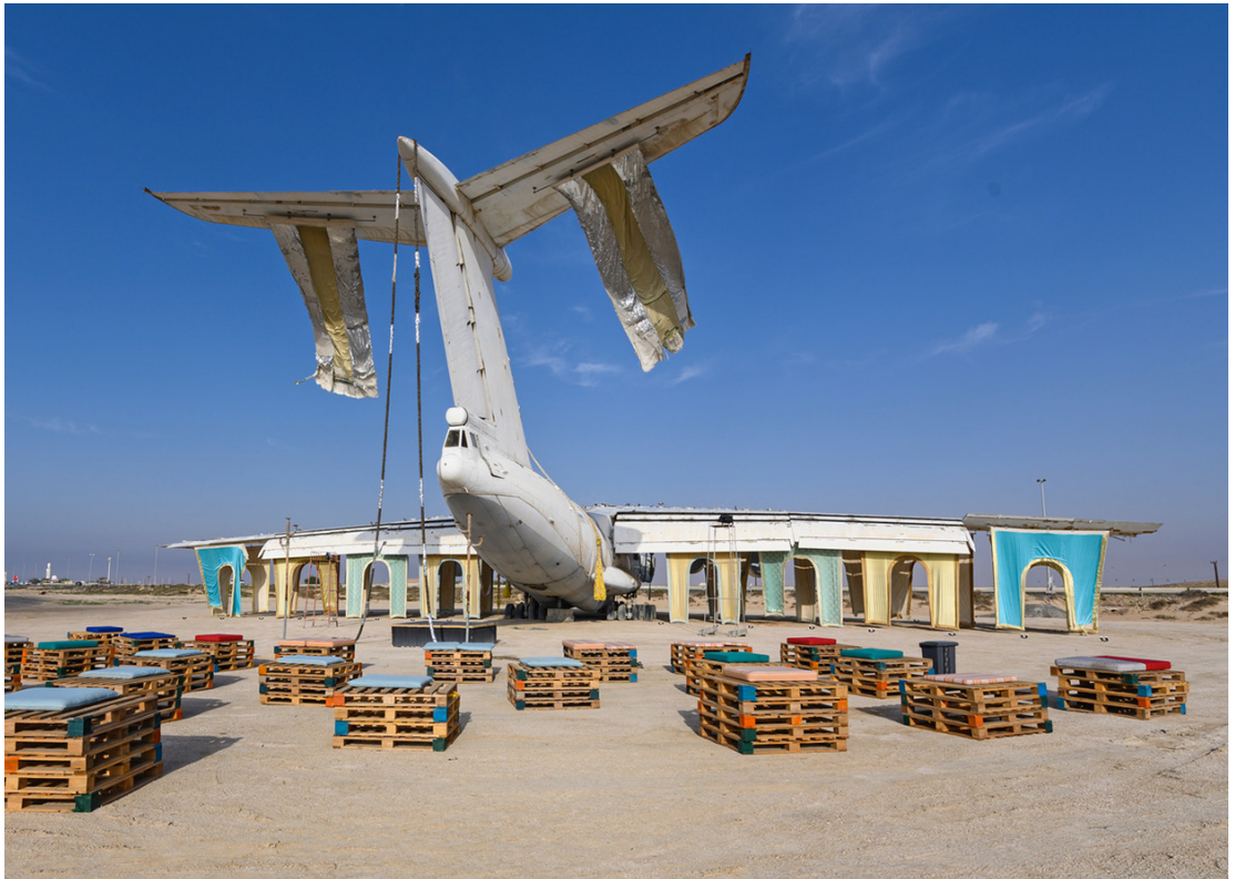
New Orleans Airlift, The Trans-National, 2019, abandoned airplane site, Umm Al Quwain.