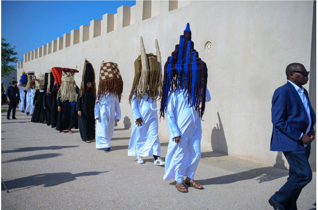
Meschac Gaba, Perruques Architecture Émirats Arabes Unis , performance, film still, 9 March 2019.

paraosipon (storytellers) or para-osip (tellers of tale). The simultaneity and equality of translation and interruption in orosipon as a radically and morphologically incomplete dialoguing refuses a complete narration. It also refuses the task of 'tell me' only to tell a different story or different stories. I am not sure how to accommodate this question in this limited opportunity, but I am compelled to ask how you to contour (test or exhaust) dialogues, monologues and storytelling in public performances.