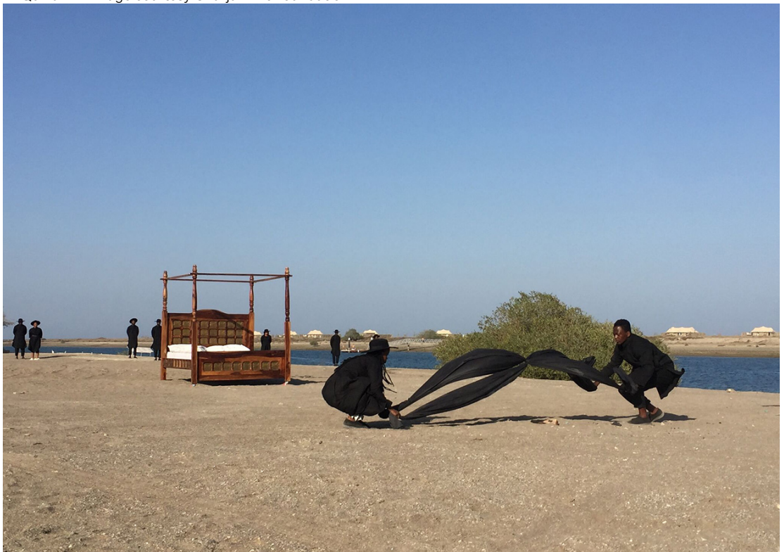
Mohau Modisakeng, Land of Zanj performance, March 8, 2019, Kalba Ice Factory.

You mentioned that translation may not necessarily occur in spite of the mediation of a curator for reasons such as different constitutions of public space and civil society. 2